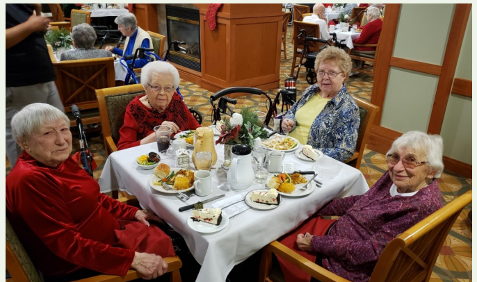
Tenants enjoying a lovely evening during our traditional Evening of Christmas campus celebration