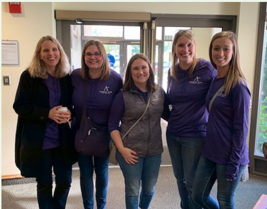
Corporate Serve the Community day. These ladies were awesome from Affinity Plus Credit Union

Nonprofit Org U.S. Postage PAID Twin Cities Permit No. 4459