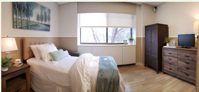
Private memory care suite

Please stay safe and healthy. Follow updates on our website at CerenitySeniorCare.org